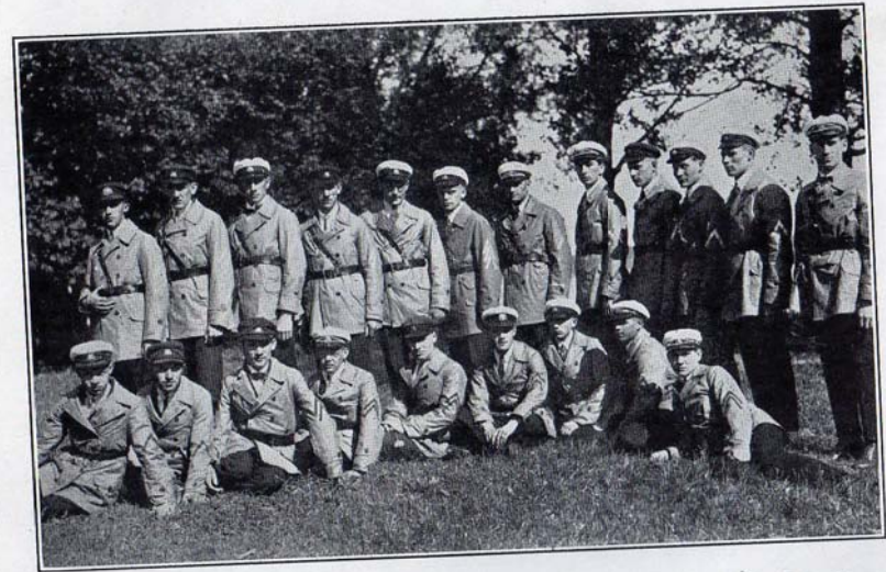
The Answer of the Latvian Workers:—A Group of Workers' Guards.